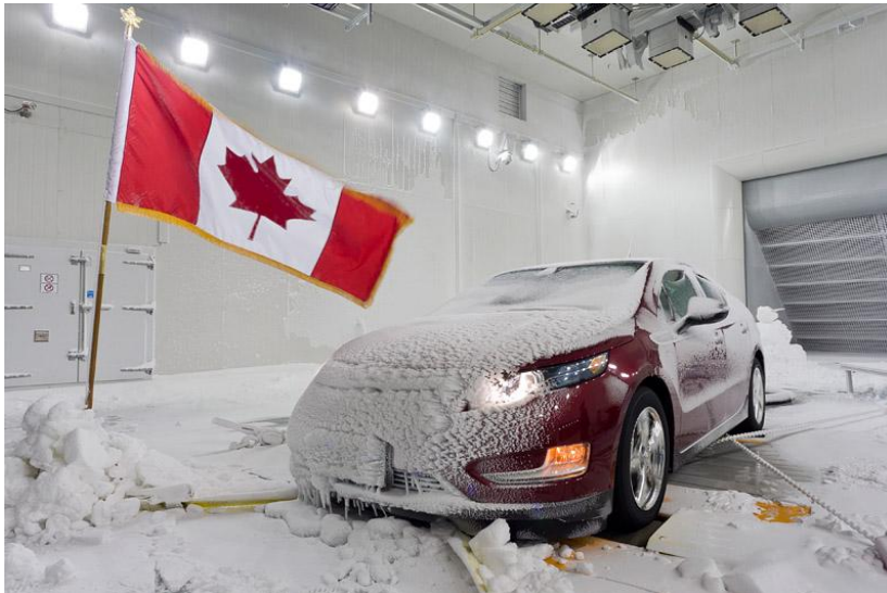
Climatic wind tunnel at UOIT-ACE